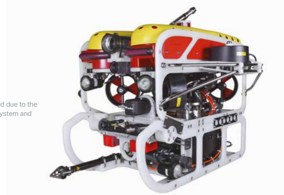
Falcon DR 1000 msw

The system can be easily customised due to the flexibility of the distributed control system and modular vehicle design.