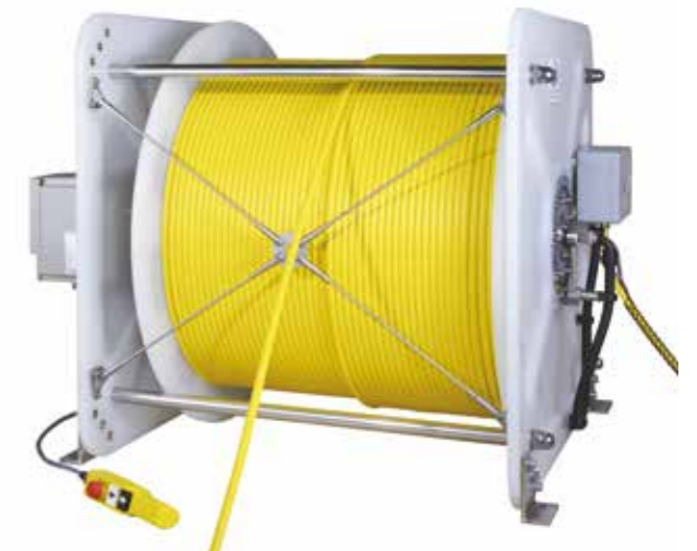
MK8 electric winch