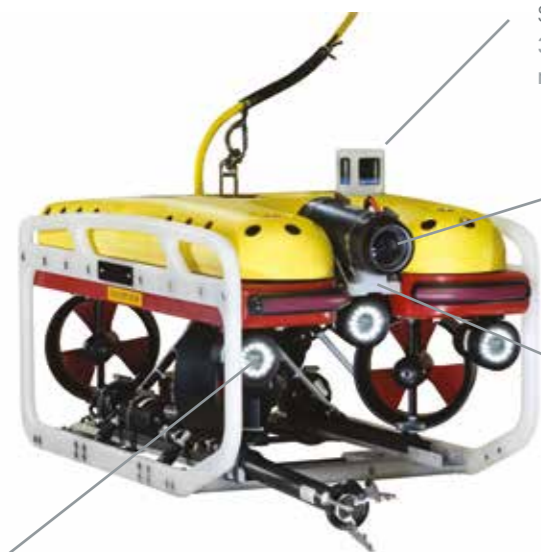
Falcon 300 msw

SONAR 360° scanning sonars for navigation and target location.