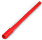
330mm mid-section extension rod 6005-0459

We manufacture a wide range of accessories and electrodes; a small selection is shown below. For a comprehensive list, please visit www.buckleysinternational.com or contact our sales team.