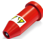
Nose Cones 6000-0008/6000-0012