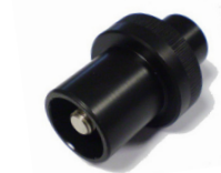
Metric - Imperial Adaptor (black) 6005-0009