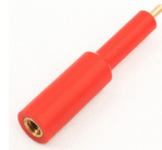
Pointed Probe Electrode 6005-0236