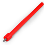
330mm end-section extension rod 6005-0460