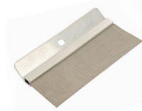
45° Gauze Mesh Electrode 128mm 6005-0376